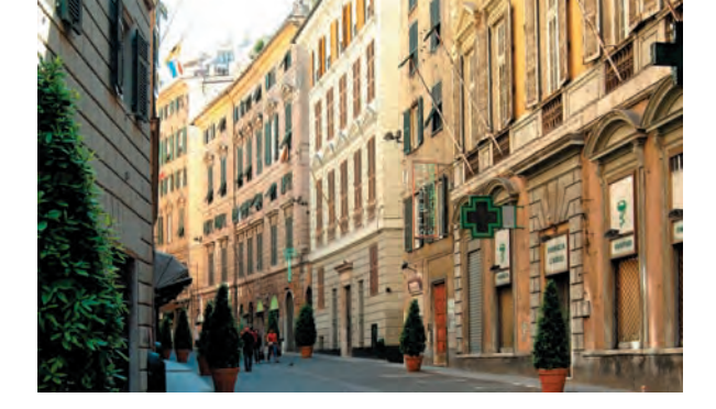
left: Two views of Palazzo Grimaldi della Meridiana. Via Cairoli. below: Luca Cambiaso Ulisse che saetta i Proci. Palazzo Gio. Carlo Brignole.